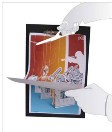
Fig1. Interaction with the artwork

After that 26 visitors has cut one page each, the artwork will reach its final state, where the wires are cut and the marionette is out of the scene (see Fig2)